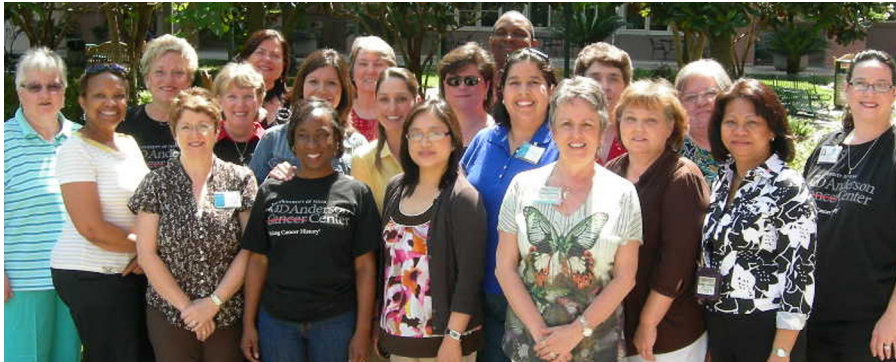
Last Year's Faculty Training Program Participants

For Faculty of Professional Nursing Programs